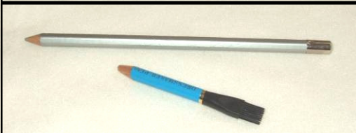
Marking Pencils or Markers