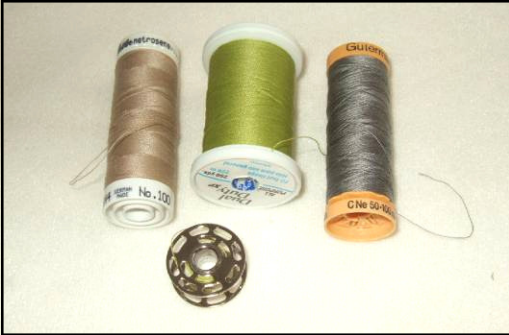
Thread and Extra Bobbins