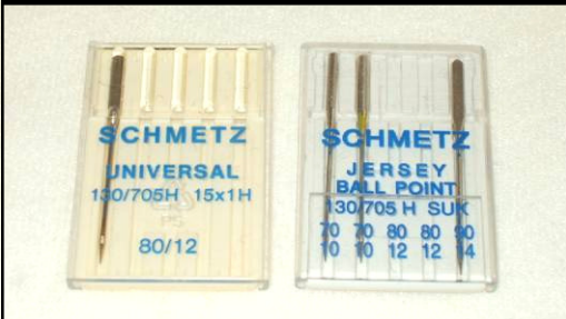
Machine Needles Universals for Wovens Ball Points for Knits